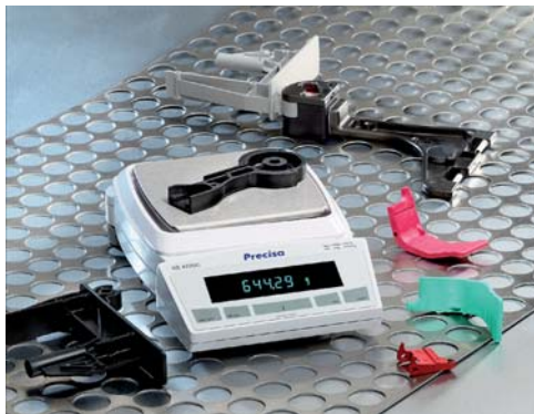
IP65 industrial protection as an option