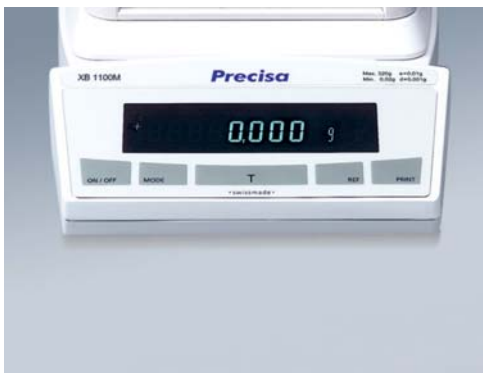
High-contrast vacuum fluorescent display