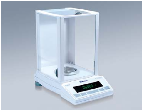
Easy operation draft shield