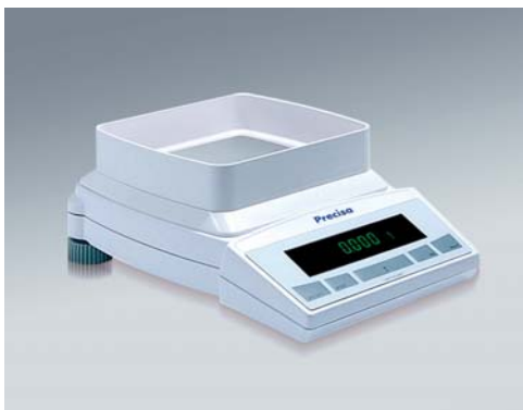
Basic draft shield for mg balances included