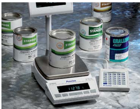
Various accessories for the simultaneous connection